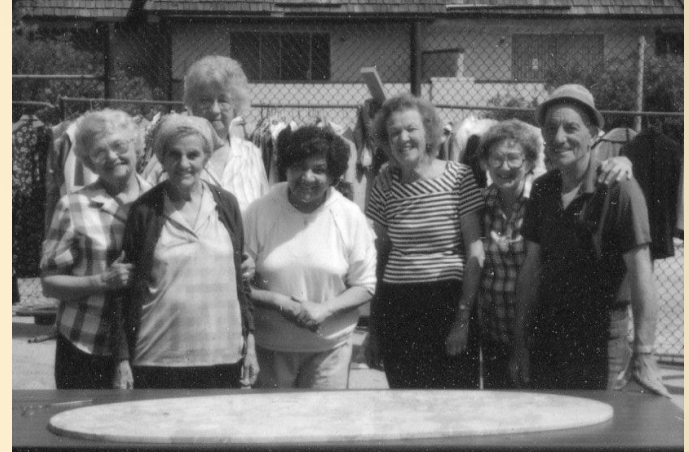
A happy crew ready to sell you one of the many items donated for the Yard Sale.