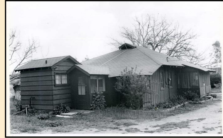
Hill Palmer Cottage in 1979